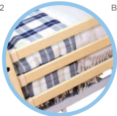
Side Rails - Beech BEA029865