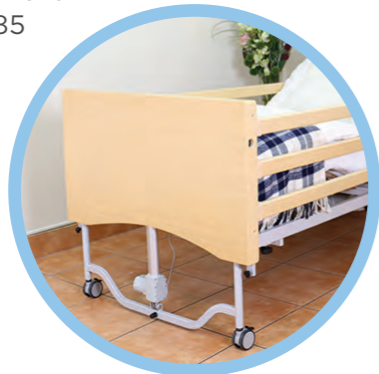
Shroud Ends - Beech BEA029845