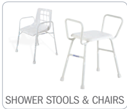
SHOWER STOOLS & CHAIRS