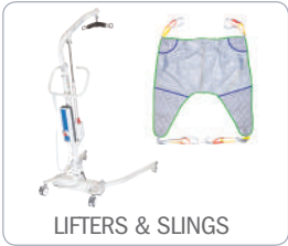
LIFTERS & SLINGS