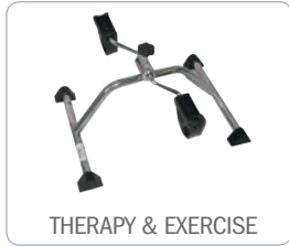
THERAPY & EXERCISE