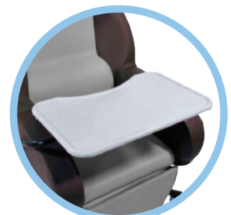
Retractable Lap Tray CHP198920