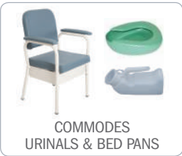
COMMODOES URINALS & BED PANS