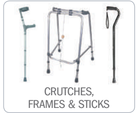
CRUTCHES, FRAMES & STICKS