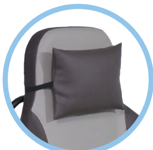
Pillow Headrest CHP198930

✓ Shell Chair Accessories are registered in the ARTG, AUST R ARTG 277232