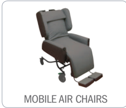
MOBILE AIR CHAIRS