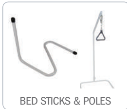
BED STICKS & POLES