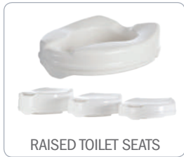
RAISED TOILET SEATS