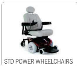
STD POWER WHEELCHAIRS