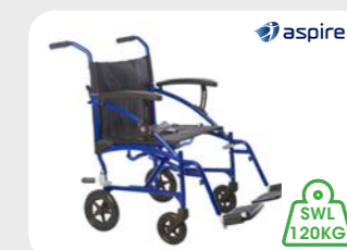
Aspire LITE Wheelchair