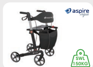
Aspire VOGUE Carbon Fibre Seat Walker