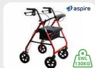
Aspire CLASSIC Walker