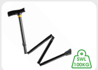
Folding Walking Stick