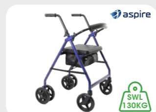
Aspire PUSH DOWN Walker