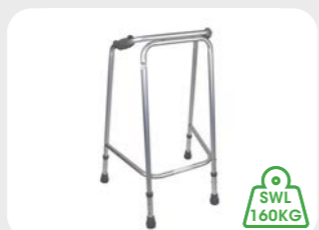
Aluminium Walking Frame