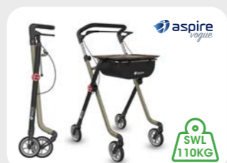
Aspire VOGUE Indoor Walker