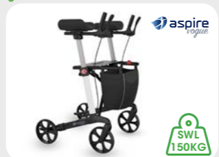
Aspire VOGUE Forearm Seat Walker