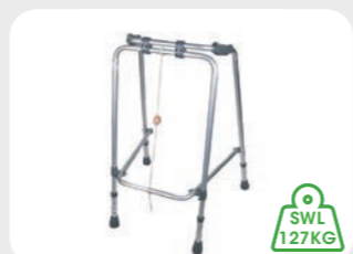
Aluminium Walking Frame Folding