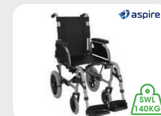
Aspire TRANSIT 2 Wheelchair