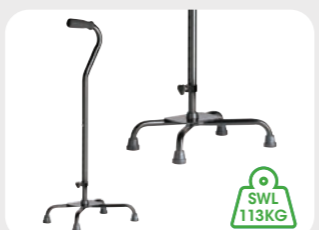
Walking Stick Quad Base