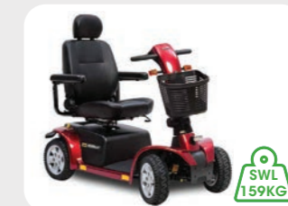
Pride Pathrider 130XL Pursuit