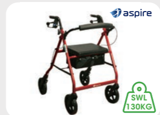
Aspire DELUXE walker