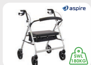
Aspire XL HEAVY DUTY Walker