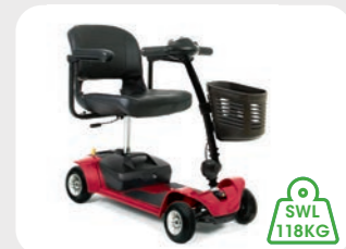
Pride Boot Scooter