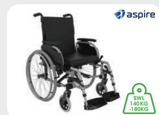
Aspire EVOKE 2 Wheelchair