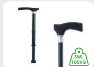
T Handle Walking Stick