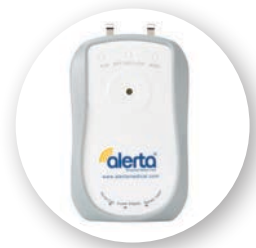
Alarm Monitor included in system