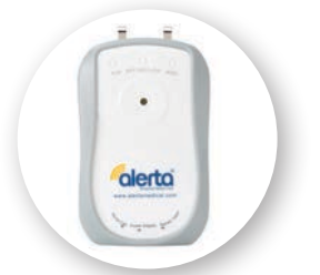
Alarm Monitor included in system