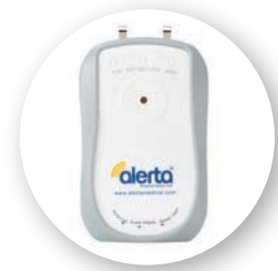
Alarm Monitor included in system