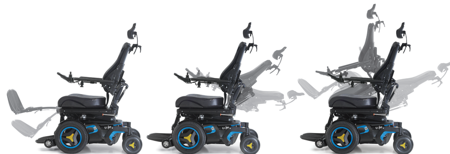
All things Corpus power features like elevating legrests 85° - 170°