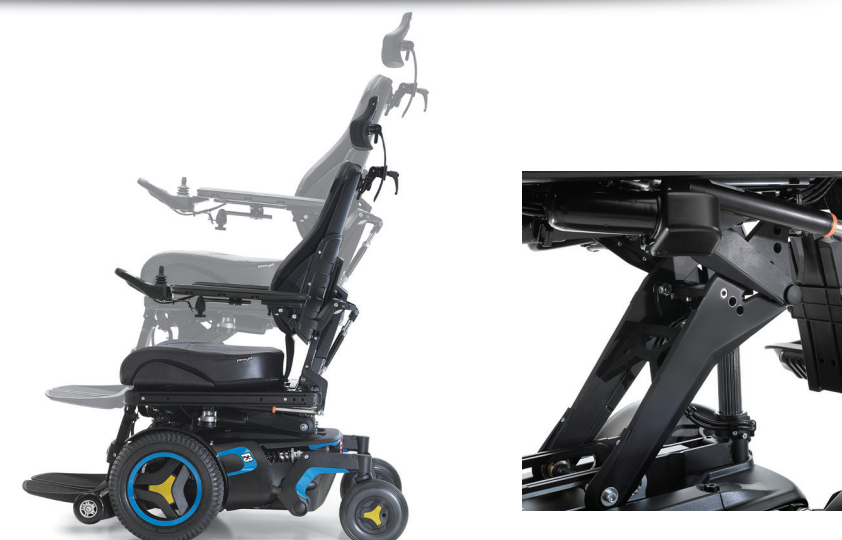
12" seat elevator that maintains three-points of contact for increased stability

THE CORPUS® SEATING SYSTEM. The F3 Corpus comes standard with all of the ergonomic and technological advances of the Corpus seating system from its sleek and stylish design that fits the contours of the wheelchair user's body to its revolutionary tilt and recline features. Unique to the F3 Corpus are the 12" seat elevator and the A/P tilt, which allows for optional 30° of anterior tilt and 50° of posterior tilt. There's no need to compromise comfort with a smaller chair, and the F3 is proof of that.