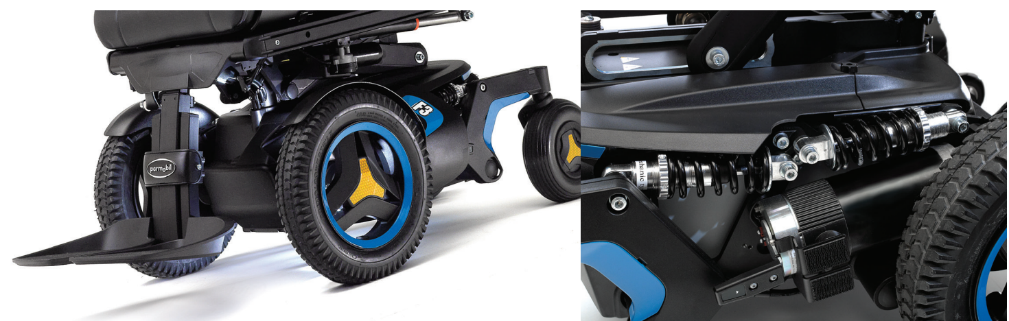
Compact maneuverability with an option to remove anti-tippers