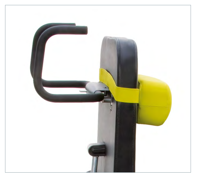
Adjustable push handles