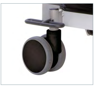
Central locking castors