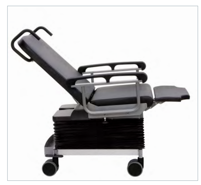
Electric patient positioning