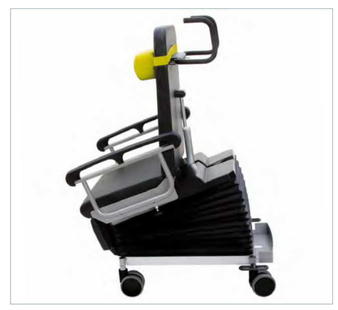
Electric sit-to-stand function

GREINER treatment couches are supplied with many inclusions as standard, however can be tailored to your precise needs. Premium covering materials and upholstery offer extra soft, wear resistant surfaces; a dynamically flexible suspension system within the seating surface supports freedom of movement for the spine, pelvis and hips, thus relieving pressure to the benefit of patients.