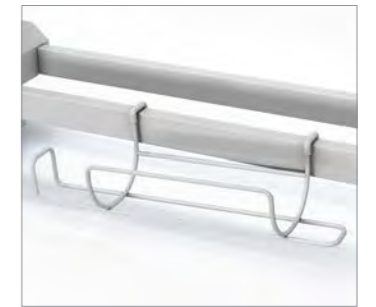
Code: PED490120 Oxygen Bottle Holder