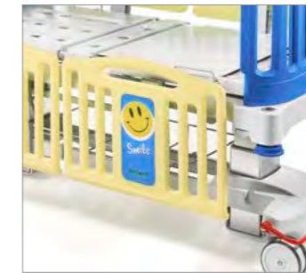
Optional printing logos upon request